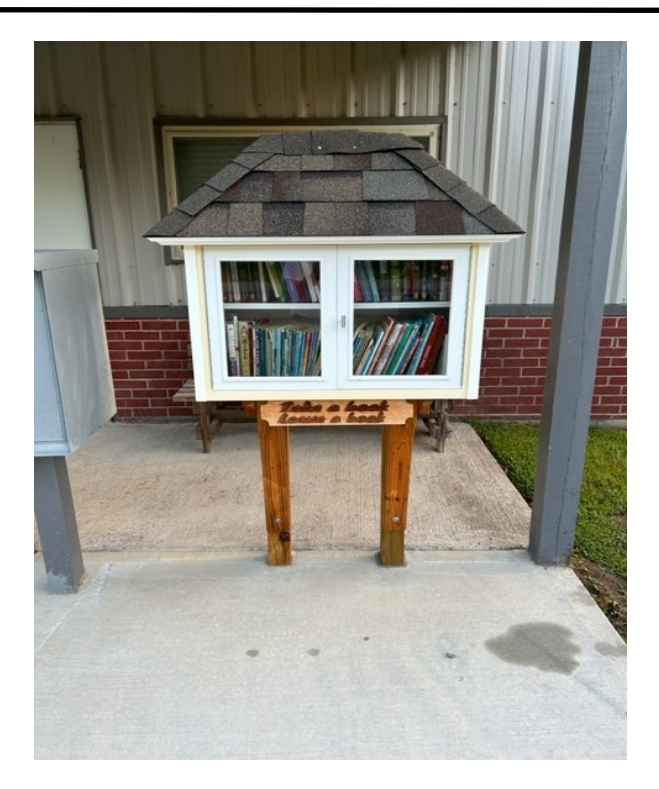
3rd Quarter 2023